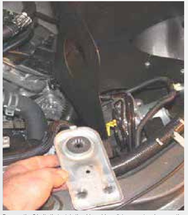
Remove the 2 bolts that retain the driver side radiator mount and remove the mount.