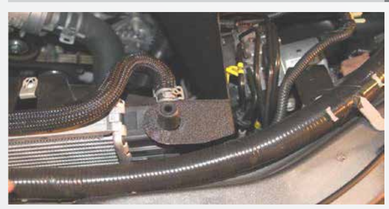
Install the BBK air filter shield into place and position over the radiator mount peg with the rubber grommets seating into their holes in the inner fender. Install the stock bolt back into the small tab on the shield and tighten the bolt. Re-install the upper radiator mount and tighten the bolts.