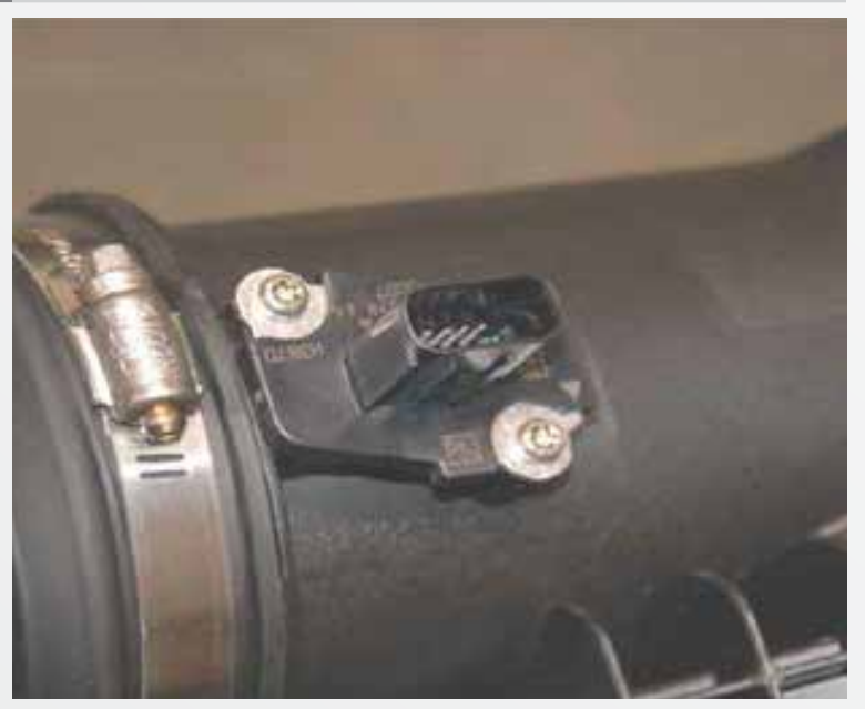
Remove the Mass Air Sensor from the stock air box tube. Install in the aluminum mounting base on the BBK inlet tube with the 2 supplied 4mm