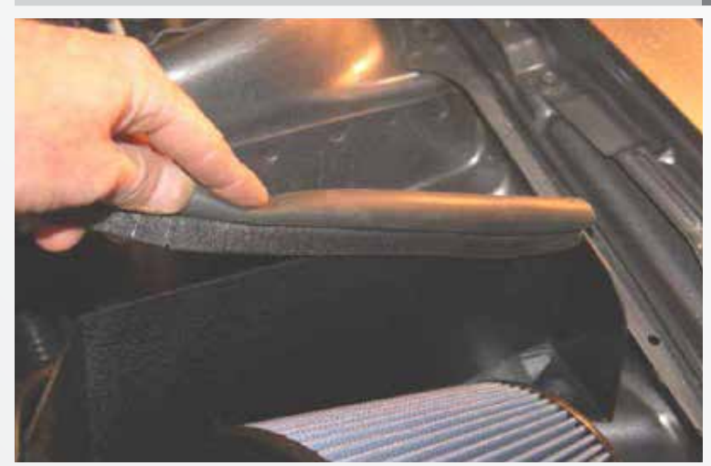
Install the supplied sponge seal to the top of the air filter shield and trim off any excess