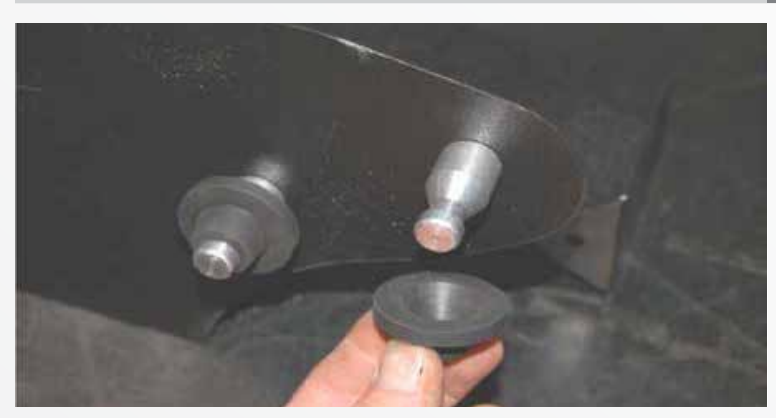
Assemble the 2 aluminum pins to the bottom of the BBK air filter shield using the supplied \frac{1}{4} -20x \frac{1}{2} " Phillips screws. Install the stock rubber grommets onto the pins.